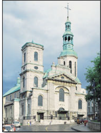
Notre-Dame de Québec Basilica

The first International Eucharistic Congress, held in France in 1881, was an assembly of 300 persons directing Eucharistic movements in European countries. During the 125 years that followed, congresses evolved strongly in form and now attract some 12,000 to 15,000 participants for one full week of celebration, adoration, catechism, cultural events, fraternal encounters, and involvement in favour of the needy. Public events, especially the closing Mass, attract considerable crowds. It should be noted that each congress is preceded by a theological and pastoral symposium to deepen understanding of an aspect of the Eucharistic Mystery.